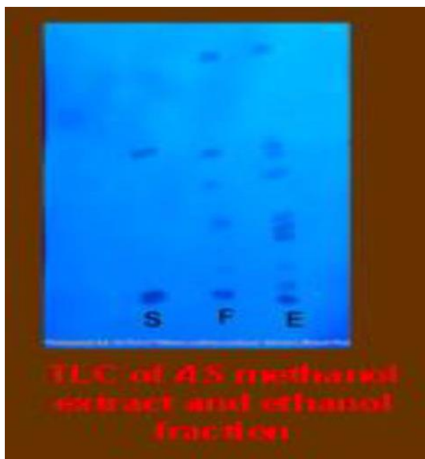
Figure No. 4.20 photograph of TLC of Annona squamosa methanol extract and ethyl acetate fraction

Figure No. 4.19 photograph of TLC of Cucumis sativus methanol extract and ethyl acetate fraction